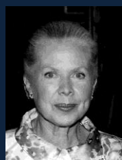
Gersende de Sabran